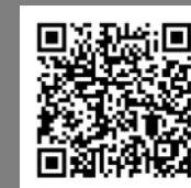
J2 series product page