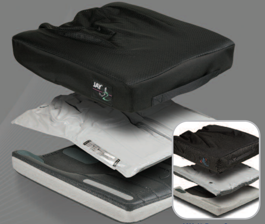
JAY J2 Deep Contour