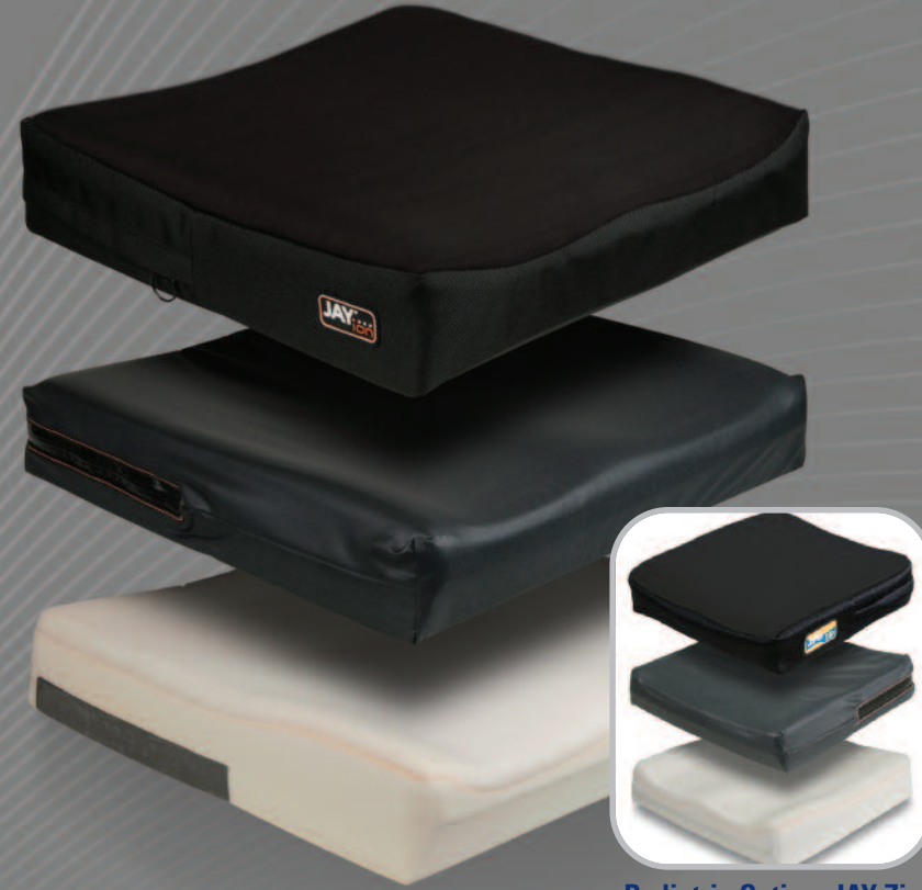
Pediatric Option: JAY Zip