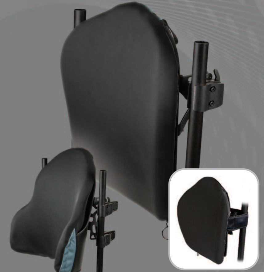
Pediatric Option: JAY Zip