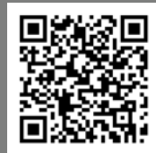
X2 product page

The JAY ® J2™ is a contoured foam cushion that features JAY Flow™ fluid and an easy-to-modify base for skin protection and stability.