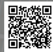
J3 Back product page